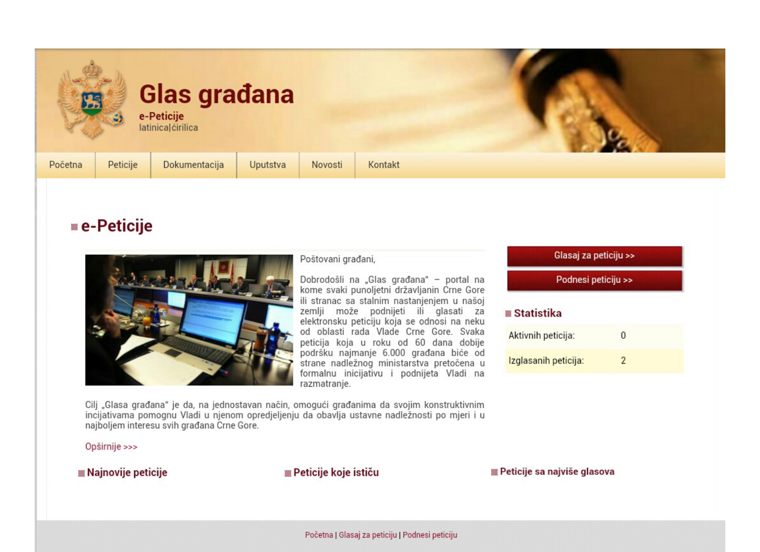
Graphics 2. Portal - Voice of citizen

At the beginning of work of the platform, some shortcomings were noticed, and according to part of civil sector, these shortcomings were limiting factor for successful implementation of the project. Part of civil society, through the membership of Operational team for implementation of Open Government partnership, but also interested organizations, gave their opinion about conditions/criteria, indicating on shortcomings and suggesting concrete proposals for improving. The most important criteria that had to be changed was about the level of prescribed census for voting on specific proposal that would be sent to the Government, on which would be discussed at the Government session.